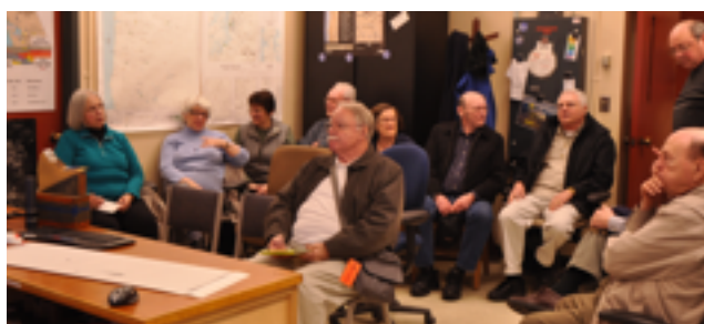
SKSR members waiting for the start.

Doug displayed the types of seismometers and described their functions. The smaller ones are used to register lesser quakes, and the larger ones filter out minor movements. In the mountain locations they often place 2-3 different types of seismometers.