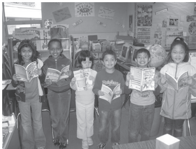
Echo Lake 2nd grade