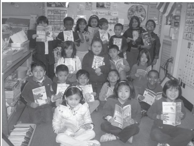
Echo Lake 1st grade