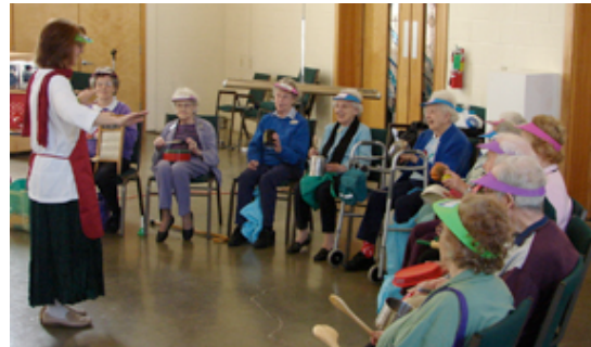
Great Bucket Bunch from Vineyard Park