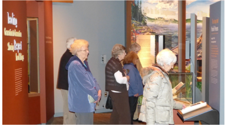
Sno-king members enjoy the exhibits at Hibulb

What a great way to combine learning new things, eating good food and visiting with fun people. That's what happened when Sno-King School Retirees took a field trip to the Hibulb Cultural Center on the Tulalip Reservation in Marysville. It is a beautiful museum. We started with a short video, and then walked through the rest of the exhibit chronically, the Tulalip tribe, the importance of canoes, salmon and caring for the environment. We then went to Bob's Burger and Brews and enjoyed a delicious lunch and more conversation. Though our numbers were small, our enjoyment was large.