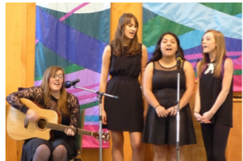
Students from Mountlake Terrace High School perform at The Sno-King School Retirees Scholarship Luncheon April 17, 2014