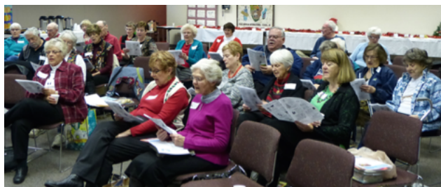
Sno-King Members Sing