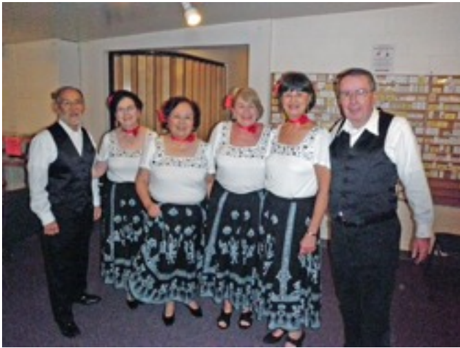
Silver Steppers of Mill Creek pose for their Photo

The entertainment was provided by The Silver Steppers from the Mill Creek YMCA. They did several dances complete with costumes, music, and lots of action. A pianist