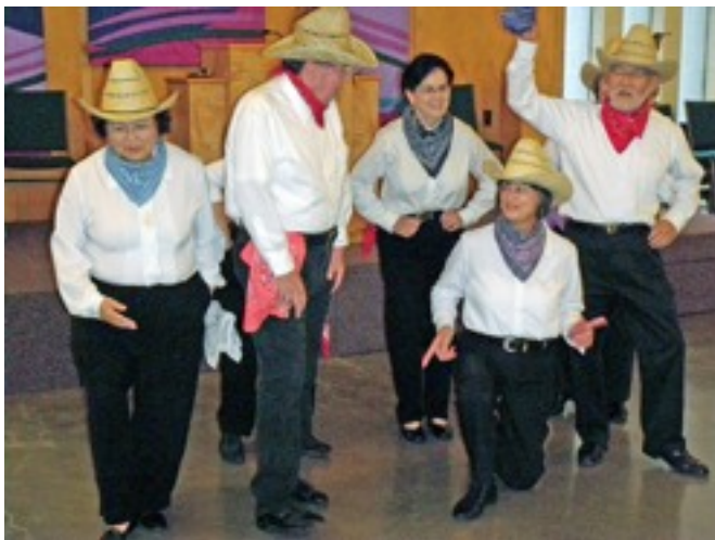
Mill Creek Silver Steppers perform their Cowboy Routine

As most of you know, this luncheon is a fund raiser for the four $1200 Scholarships that we give to graduating high school seniors from the districts we represent. With donations, ($140 in memorials and $155 in donations) raffle collection ($215), and paid lunches ($245), we raised a total of $755. We hope to see lots of you at the April 15 th Scholarship Luncheon. Look for more information in the Bulletin as the time draws nearer.