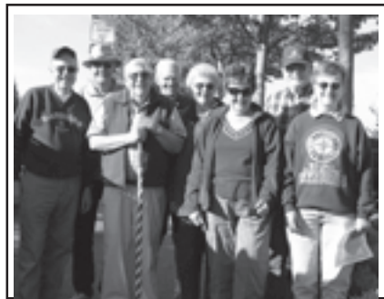
October 12th Walkers