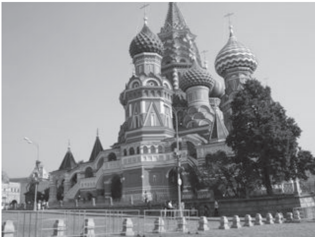
St. Basils Cathedral Moscow

A beautiful stop was at Kizhi Island at 61° N. latitude in Lake Onega. It is home to some of the finest wooden churches in Russia, including the fairytale 22-domed Church of the Transfiguration built in 1714.